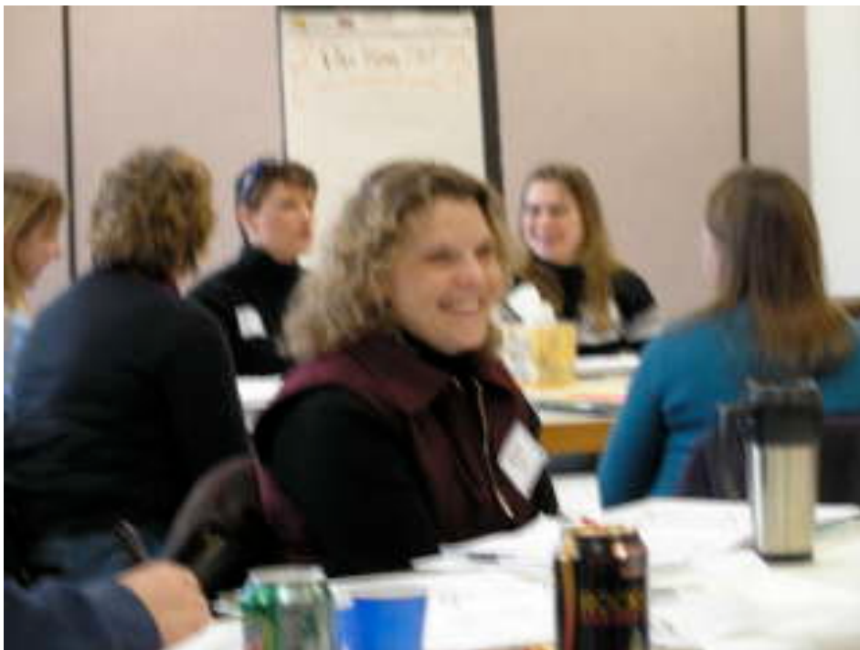
Teachers take advantage of PDP Verification Team Workshop offered by WSC on Saturday, February 9, 2008.

yearly progress monitoring. Participants will be introduced to resources that outline effective, research-based instructional strategies and will be able to access state and federal student achievement data to discuss the implications of using learning outcome data. The registration fee of $150 includes lunch, refreshments and workshop materials. Register online at www.education.wisc.edu/outreach or by phone at (608) 262-0810. For more information about this workshop, contact Sue Schroeder at (608) 263-0951 or sueschroeder@education.wisc.edu .